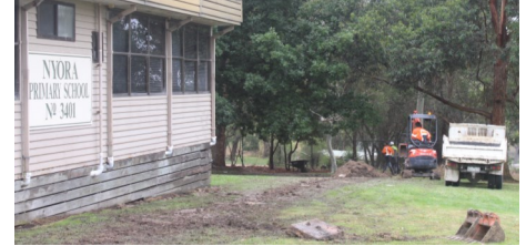
Image: Connection of Nyora Primary School January 2015