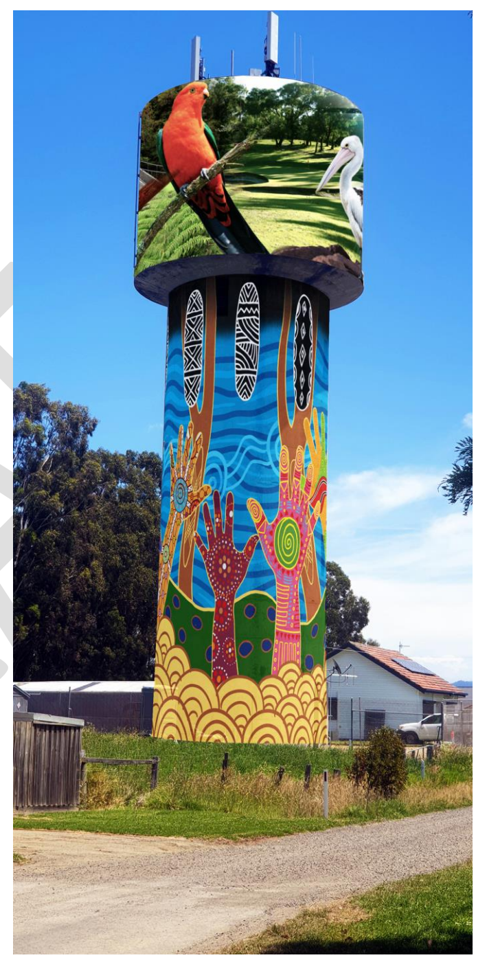
Figure 1 Artists Impression Water Tower Mural

the tower with an acrylic weather protectant coating. These works are integral for the on-going safe operation and structural integrity of the tower.