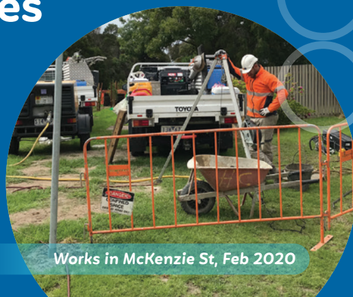
Works in McKenzie St, Feb 2020