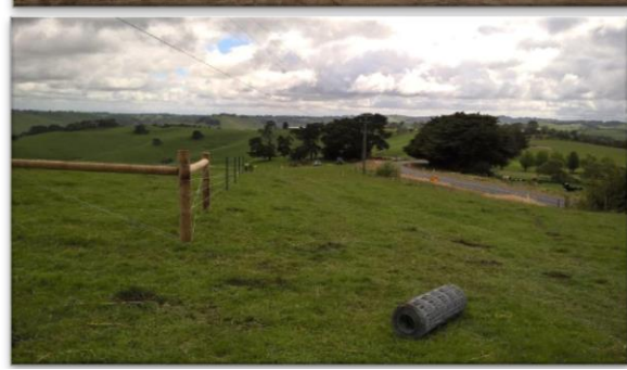
Top – Delivery of high density polyethylene (HDPE) pipe. Middle – Survey work locating existing fibre optic infrastructure. Bottom – Temporary fencing of the construction corridor adjacent to Korumburra-Wonthaggi Road, Jumbunna.

Recently, members of the Lance Creek Water Connection project team inspected some of the 10km of 502mm mild steel cement lined piping produced for the project in Somerton by Steel Mains.