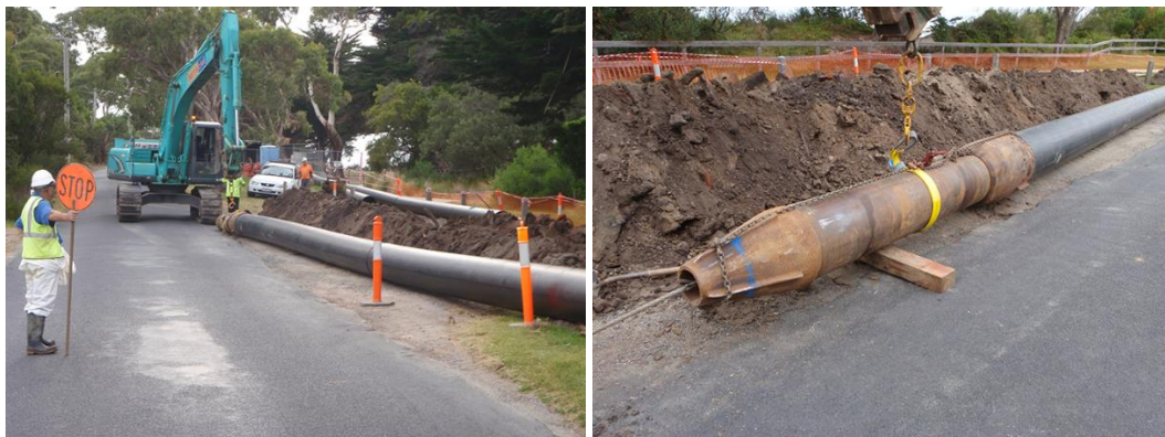
Image: Pipe bursting and the bursting head used in the sewer upgrade along Ramsey Boulevard, Inverloch in 2014

A: For the most part, this technology involves less excavation, as it does not require deep trenches the entire length of the pipes to be replaced.